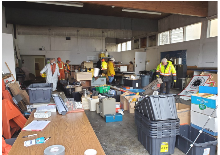
NARA members sorting through club items on March 21

The NARA Newsletter is published on the last Friday of each month for the month following. If you have items for the newsletter or comments please send them to: