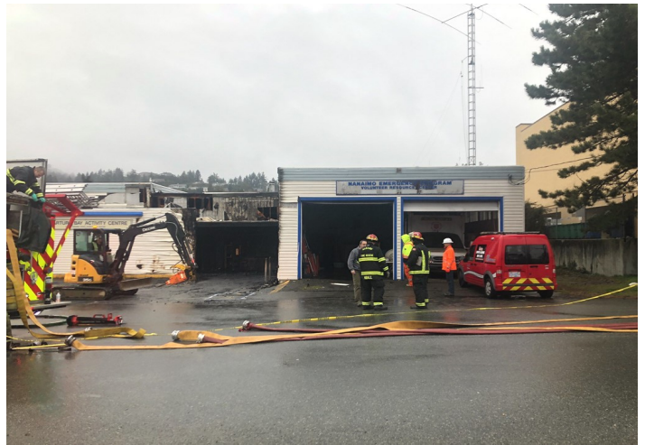
Firefighters on scene at Wingrove Street on March 17

A group of volunteers attended the burnt out Wingrove Street site on March 21-22 to salvage and remove club contents. There are too many to thank here, from organizers to those who did the heavy lifting, but you know who you are. Items had to be sorted, packed, catalogued, photographed, and then taken to one of several storage sites. Fire did not impinge on either the radio room or tech room and no club equipment appeared to suffer catastrophic damage, though smoke damage remains a concern. Finally, a huge thanks to Nanaimo firefighters whose good work prevented the damage from being more extensive.