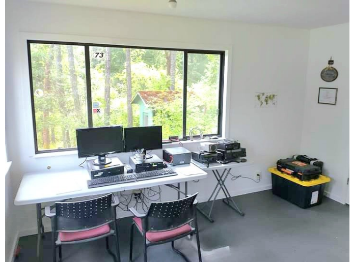
The VE7NA Canada Day shack

The August issue of the Newsletter will contain reports for both events. There are some changes to the Canada Day contest rules this year. For details see the RAC website, https://www.rac.ca/rac-canada-day-contest-rules-2022/#English .