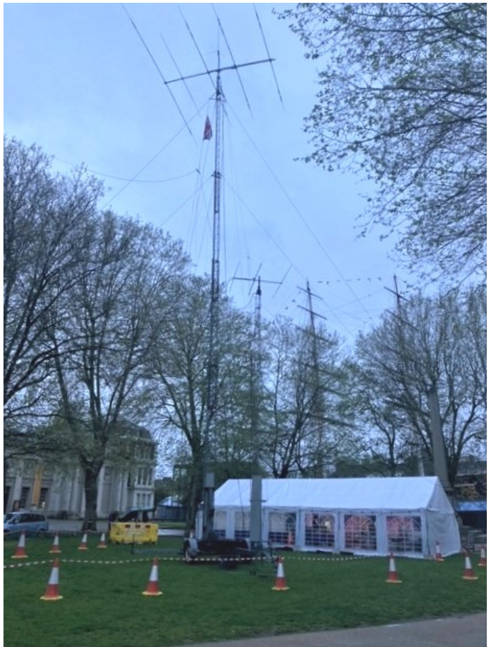
The special event station GB23C celebrating the Coronation of King Charles III, from the Royal Naval College near London, attracted large numbers of the general public

On the day of King Charles III Coronation I was looking for the flagship station GB23C. They were operational on 28 MHz CW but I could not hear their signal. Fortunately, I knew the organizer and I emailed him. A little later GB23C appeared on 20m CW beaming on the Pacific north west, and despite conditions being really poor we managed to make contact at 559 each way.