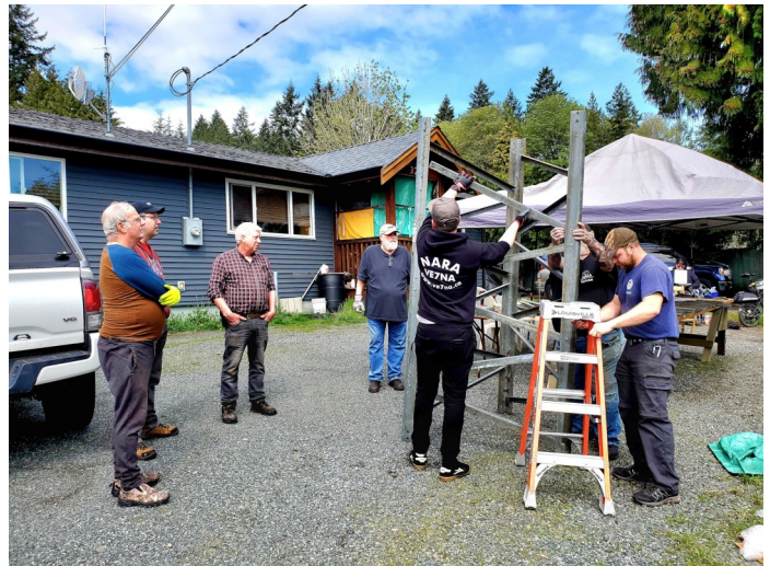
The first tower section has been completed thanks to lots of help and advice by NARA members