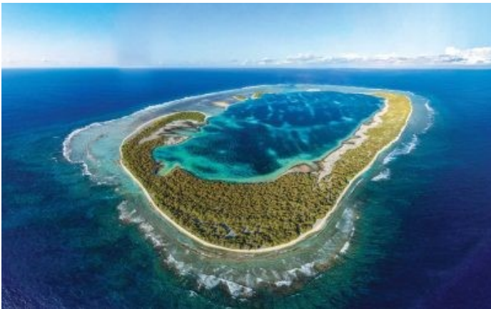
Lonely and uninhabited Ducie Island located in the South Pacific counts as a separate DXCC entity

Ducie Island is another rare DXCC entity and well worth trying from Nanaimo. The path from Nanaimo is almost due south and mostly over water, which is an advantage because HF signals returning from the ionosphere tend to reflect up again to the ionosphere if the earth-bounce part happens over water. The dates for this DXpedition are from June 10-24.