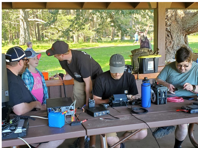
The main operating position for the SSB and CW stations using the park benches also supplied as part of the hire