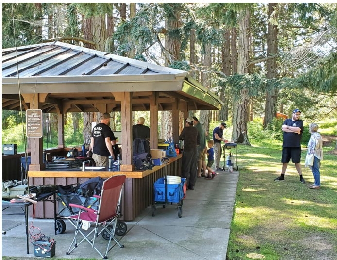
General view of the site at Rathtrevor Park. The hire of the site included the permanent park canopy complete with running water. Power was supplied by batteries

Over 20 visitors enjoyed the above seasonal temperatures for the POTA activation arranged by Mason VE7PMD on Saturday, May 13. Several stations were set up and contacts were made on SSB, CW and digital modes into Canada/US on HF. The Rathtrevor Park location in Parksville (POTA VE-4012) was perfect with nearby trees offering shade from the sun. A fun POTA activation and definitely worth doing again.